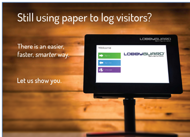
Above: The front of the Corporate / Government Info Card

The info cards are the size of a postcard and are available in two formats: Schools and Corporate / Government. The cards provide a powerful attention-getting message that drives the customer to seek more information from a LobbyGuard Sales Representative, who will provide a product demonstration and price quote to the customer. Below are images of the two info cards: