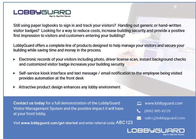
Above: The reverse of the Corporate / Government Info Card